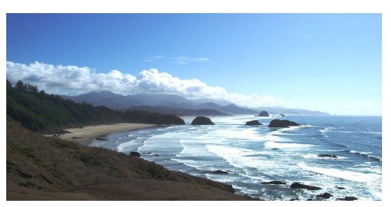
NATURE Dawn Everling