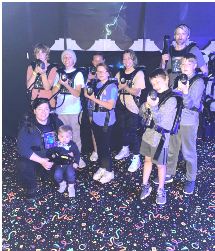
Youth group at Grand Slam Entertainment Center