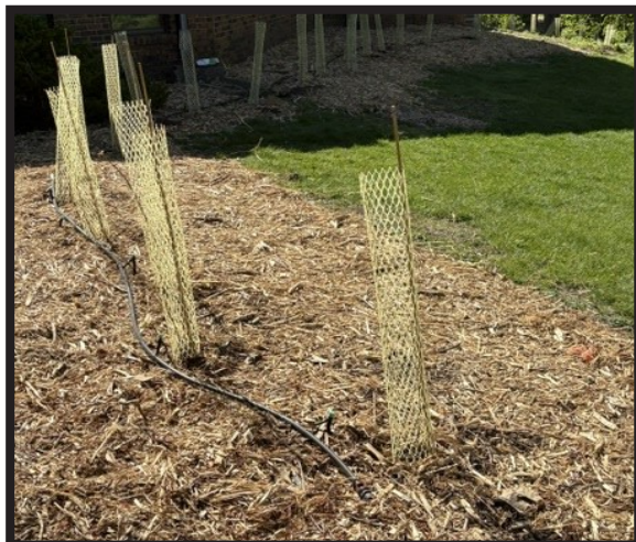
New service berry plantings